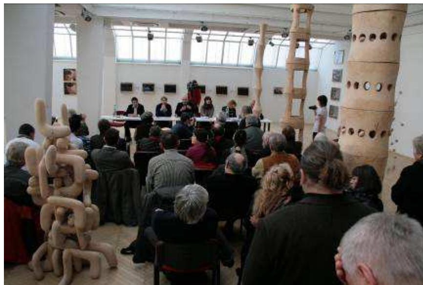
... and again protest meeting of artists at the Gallery of Slovak Union of Visual Arts ...

- The World Art Day – April 15 th , 2012: similar event, organized by the Slovak Union of Visual Arts on Leonardo da Vinci's birthday. This event was organized within the 2011 initiative of International Association of Art which declared da Vinci's birthday a World Art Day. The action caught the attention of the media, we have seen many responses. Photo report from event here: