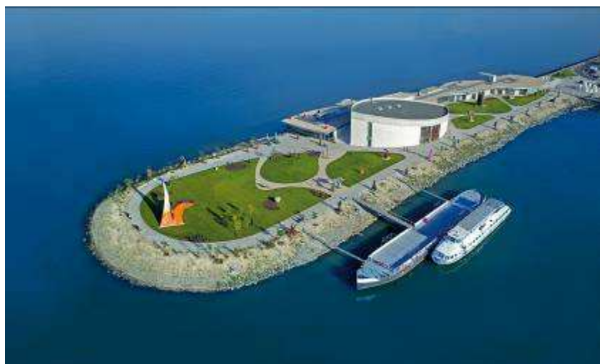
Meulensteen Art Museum Danubiana, Bratislava - Čunovo