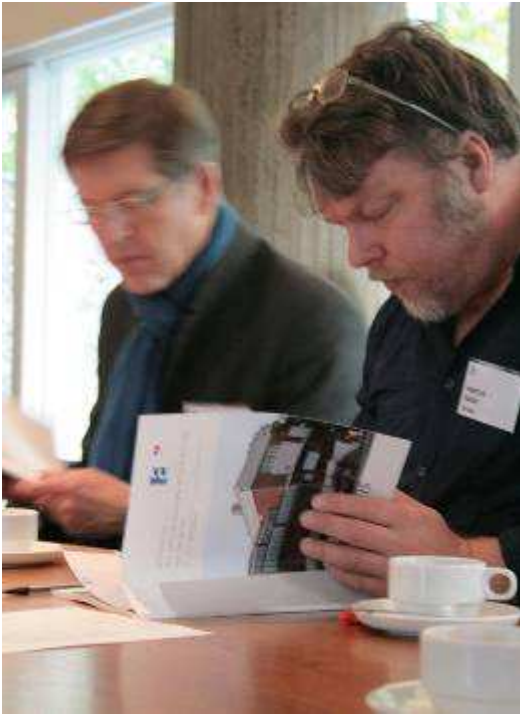
PDF document on website – this is what I call working group.